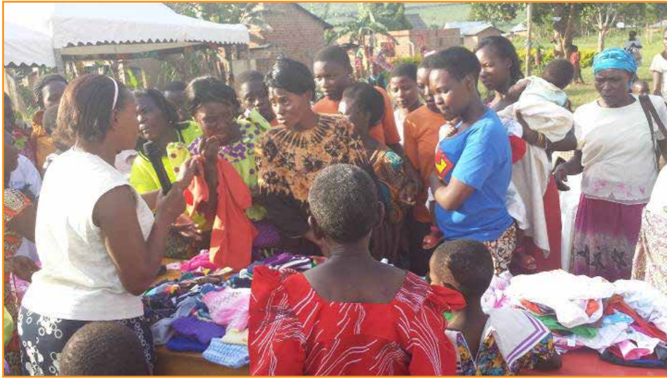
Some Items brought by visitors and Volunteers

Volunteers participated in the VICOBA camp 2014 and facilitated workshops and seminars on health and business. Volunteers carried a number of equipment and items like stationary, clothes, shoes and many other items.