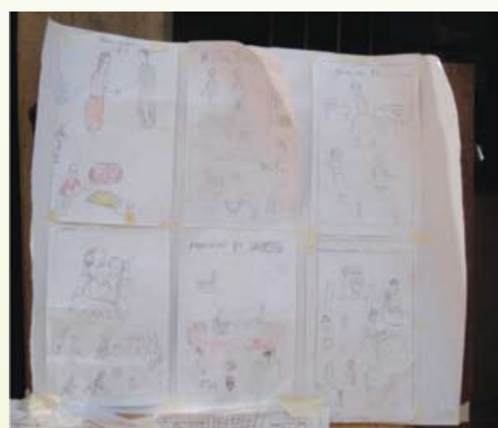
Top left: Crafts session Top right: cooking lesson Bottom left: HIV/AIDS performance Bottom right: HIV/AIDS posters by children

It is important to integrate disabled, orphaned and poor children into the community and to give them opportunities to experience things that other children are privileged to experience. Thus, with the help of international volunteers, Kitega staff organized a field trip to the zoo and the local airport for the children. Staff and volunteers also organized a football match between Kitega children and Katungulu children (alas, Kitega lost 1-0).