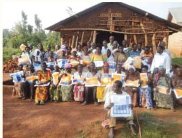
Mosquito net distributed to community