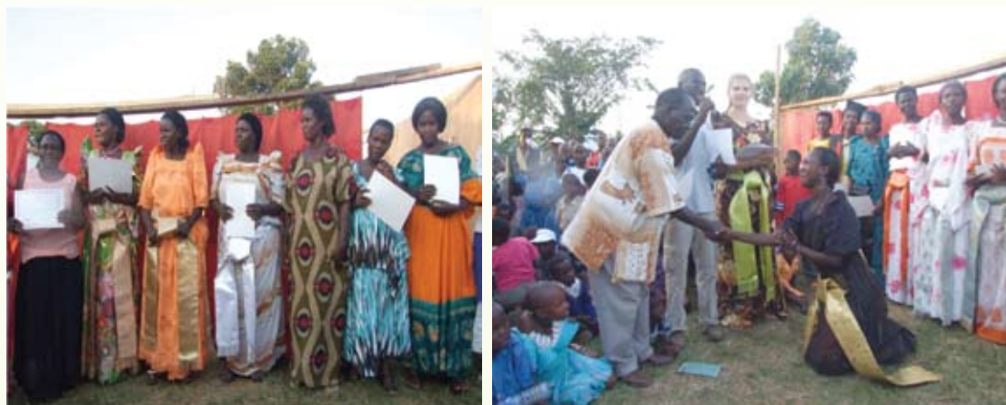
Kitega women receive certificates after completing VICOBA training.

Generating income and creating jobs are central to Kitega's mission to alleviate poverty, and in 2010 Kitega community witnessed the success of VICOBA, the village community banking program. VICOBA is a community bank that came into being when a group of village women pooled their savings to form a community bank. With the help of donations from Kitega supporters, VICOBA built up enough reserve to enable the bank to make loans to support micro-enterprises. The VICOBA program has been a great success, and Kitega staff was thrilled to document the variety ways that program participants used the funds to start small businesses. Successful microenterprises included the following: a quarry mining business, a grocery store, a cabbage farm, a poultry farm, a banana farm, and a distillery business.