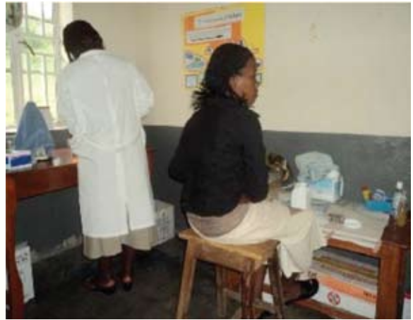
Health centre in Bushenyi

Jiggers, a flea-like bug, were also rampant in the communities, and some of the homes were infested. Jigger bites can cause painful sores, inflammation, legions and infections and can lead to more serious problems like gangrene, tetanus and loss of limbs. To fight jigger infections, the centre bought a sprayer and insecticide to spray some of the affected areas, and this helped to reduce jigger infections.