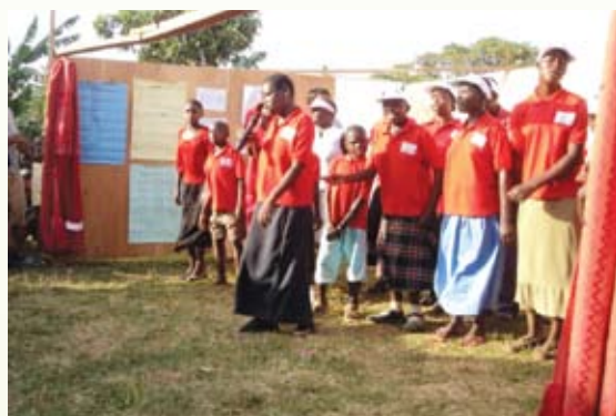
2010 Christmas celebration