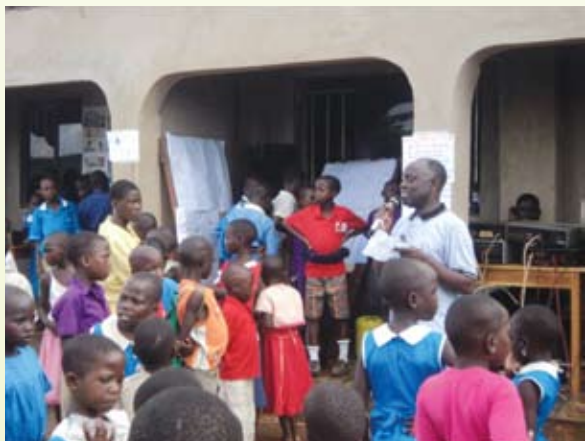
Children gather to observe International AIDS Day