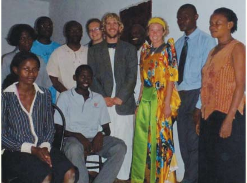
Board members and staff, with international volunteers