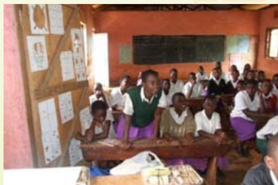
Children discuss the concept of dignity on Global Dignity Day