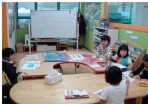
Students of Kyoung Hee Kindergarten writing letters to their Ugandan Friends

The children have been exchanging cards and letters, and we hope to find more pen pals for them.