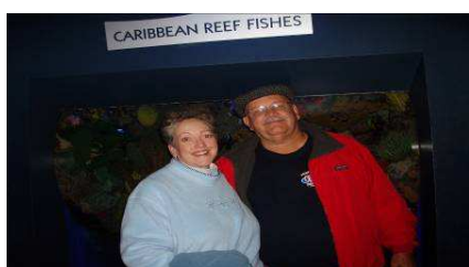
The Cloers (USA)